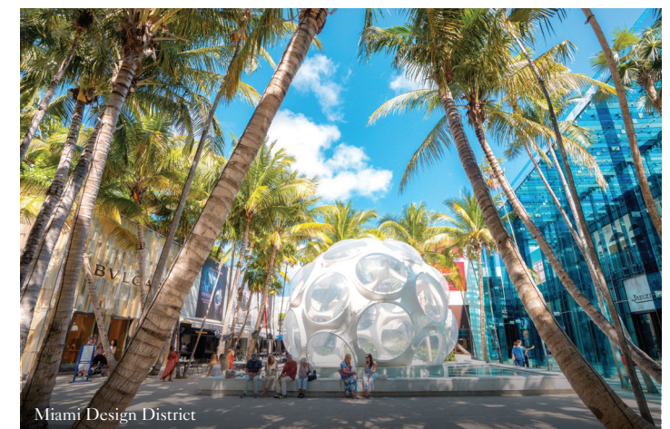
Miami Design District