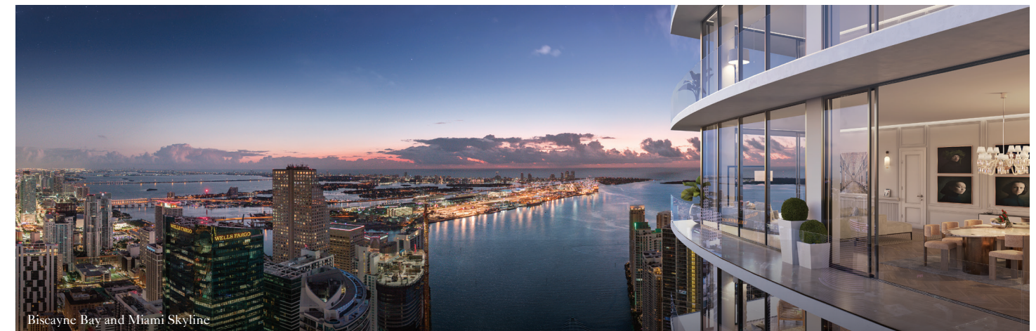
Biscayne Bay and Miami Skyline