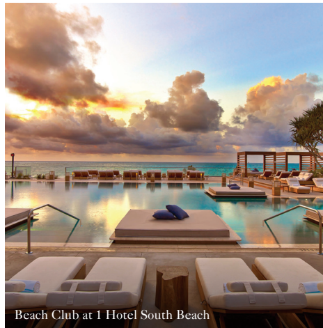
Beach Club at 1 Hotel South Beach

The private marina, planned riverside restaurant and lushly landscaped river promenade invite residents to spend hours and days luxuriating in the infinite energy and organic sparkle of life by the water. Watch the superyachts come and go, take a sunset stroll towards the bay, or head to a number of chic waterside restaurants courtesy of our private water taxi service. Residents can enjoy private membership and exclusive access to the Beach Club at 1 Hotel South Beach, SH Hotels & Resorts sister property. With loungers, beach towel services, cabanas, and seaside snack and beverage services, this waterfront community will cater to leisurely hours under the sun. Take a break from the hustle and bustle of the city and unwind with a cool drink in hand and the sand between your toes.