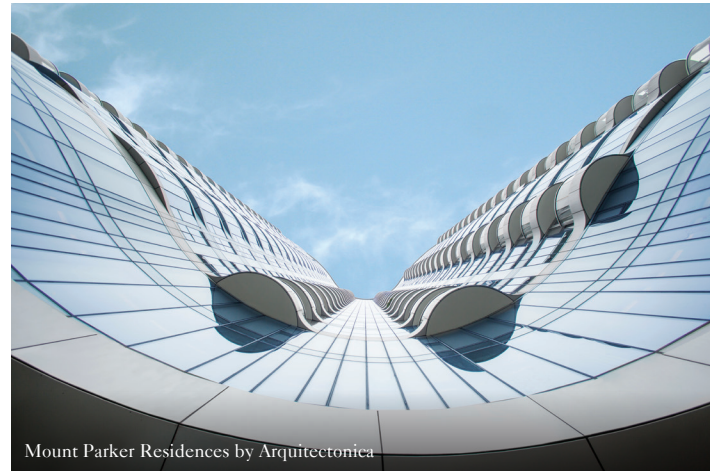
Mount Parker Residences by Arquitectonica