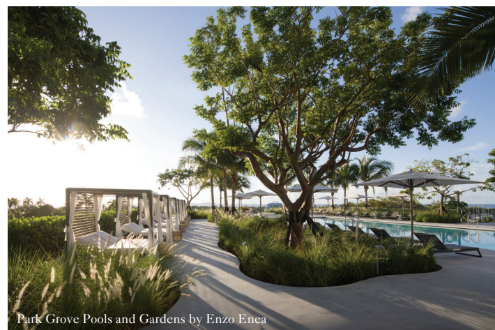
Park Grove Pools and Gardens by Enzo Enea