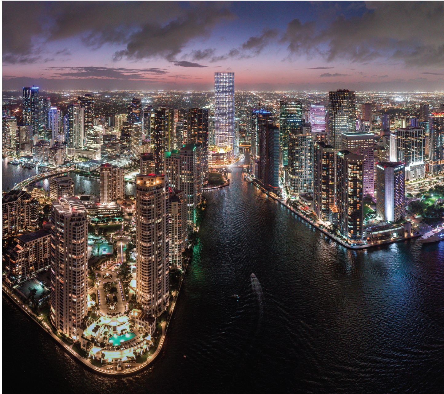
Above: Artist's Conceptual Rendering