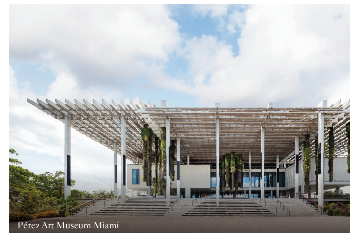
Pérez Art Museum Miami