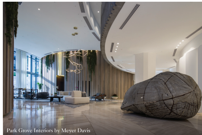
Park Grove Interiors by Meyer Davis