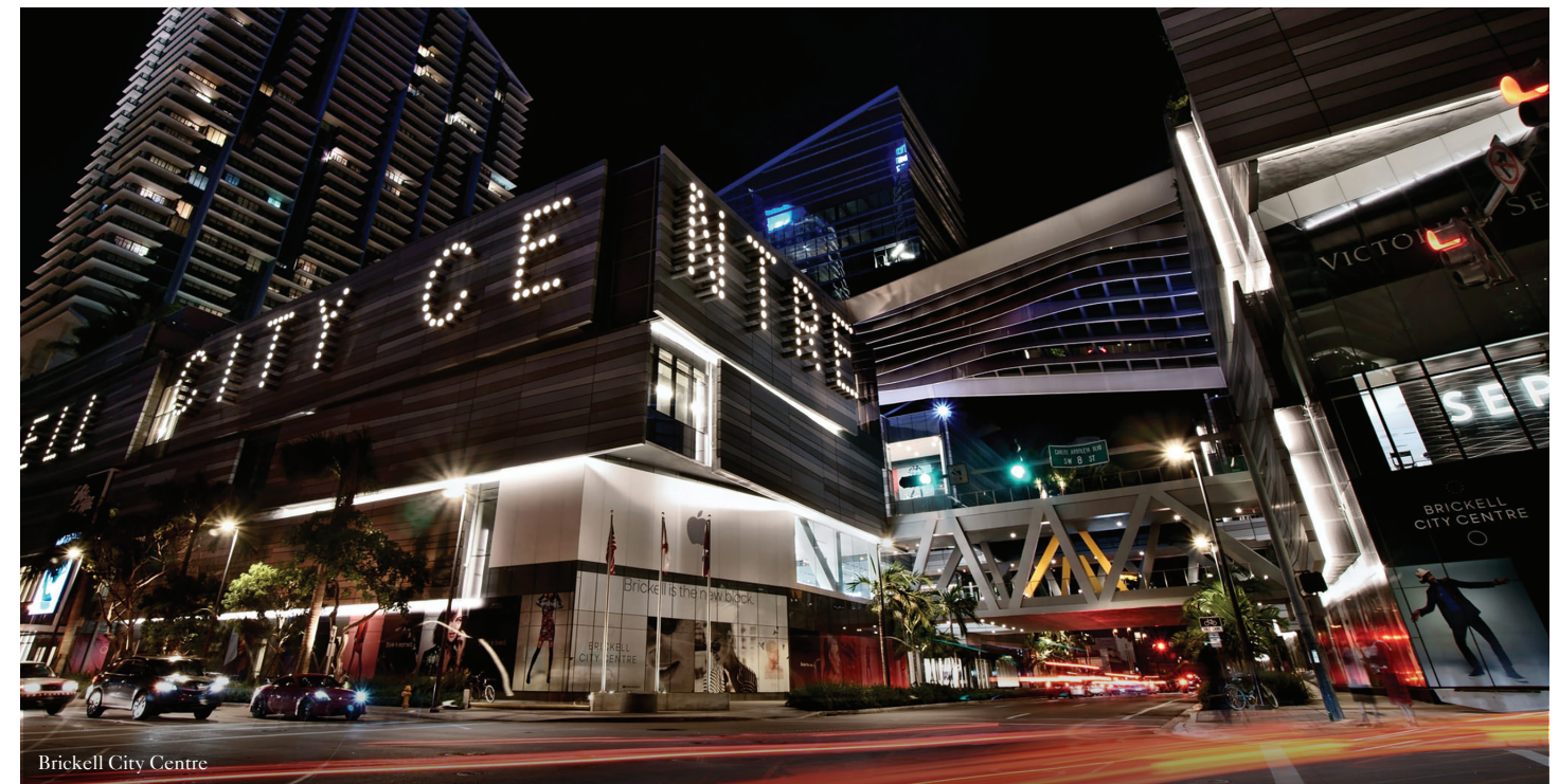
Brickell City Centre

Perfectly positioned at the entrance of Brickell Avenue, where the Miami River meets the beautiful blue waters of Biscayne Bay, and the bustling financial district blends with high-end shopping, top restaurants, cultural hot spots and exciting nightlife—this iconic neighborhood is an all-day all-night lifestyle destination, aptly named the Manhattan of the South.