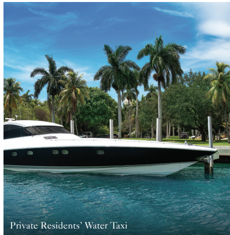
Private Residents' Water Taxi