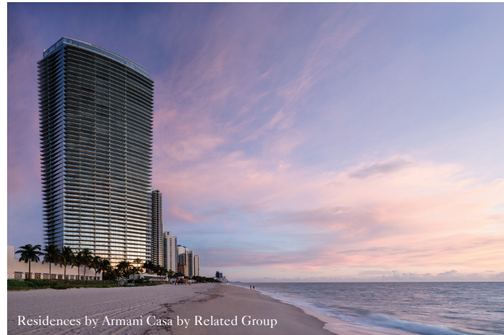
Residences by Armani Casa by Related Group

Renowned Swiss landscape architect Enzo Enea of Zurich-based Enea Garden, is one of the leading landscape architects in the world. A hallmark of Enzo Enea's work is the fusion of indoor and outdoor spaces, the creative intertwining of the soul of the residence with its surroundings.